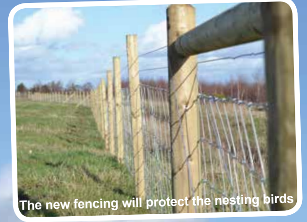
The new fencing will protect the nesting birds

We apologise for any inconvenience this may cause but we hope you understand the importance of protecting these rare animals.