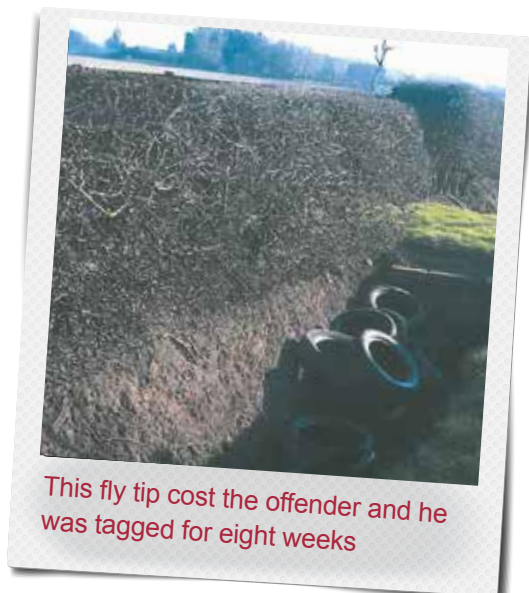
This fly tip cost the offender and he was tagged for eight weeks

If you witness a fly-tip then a vehicle registration and description of the person could be enough for us to catch them. Contact us on 0115 901 3972 or email environmentalhealth@gedling.gov.uk